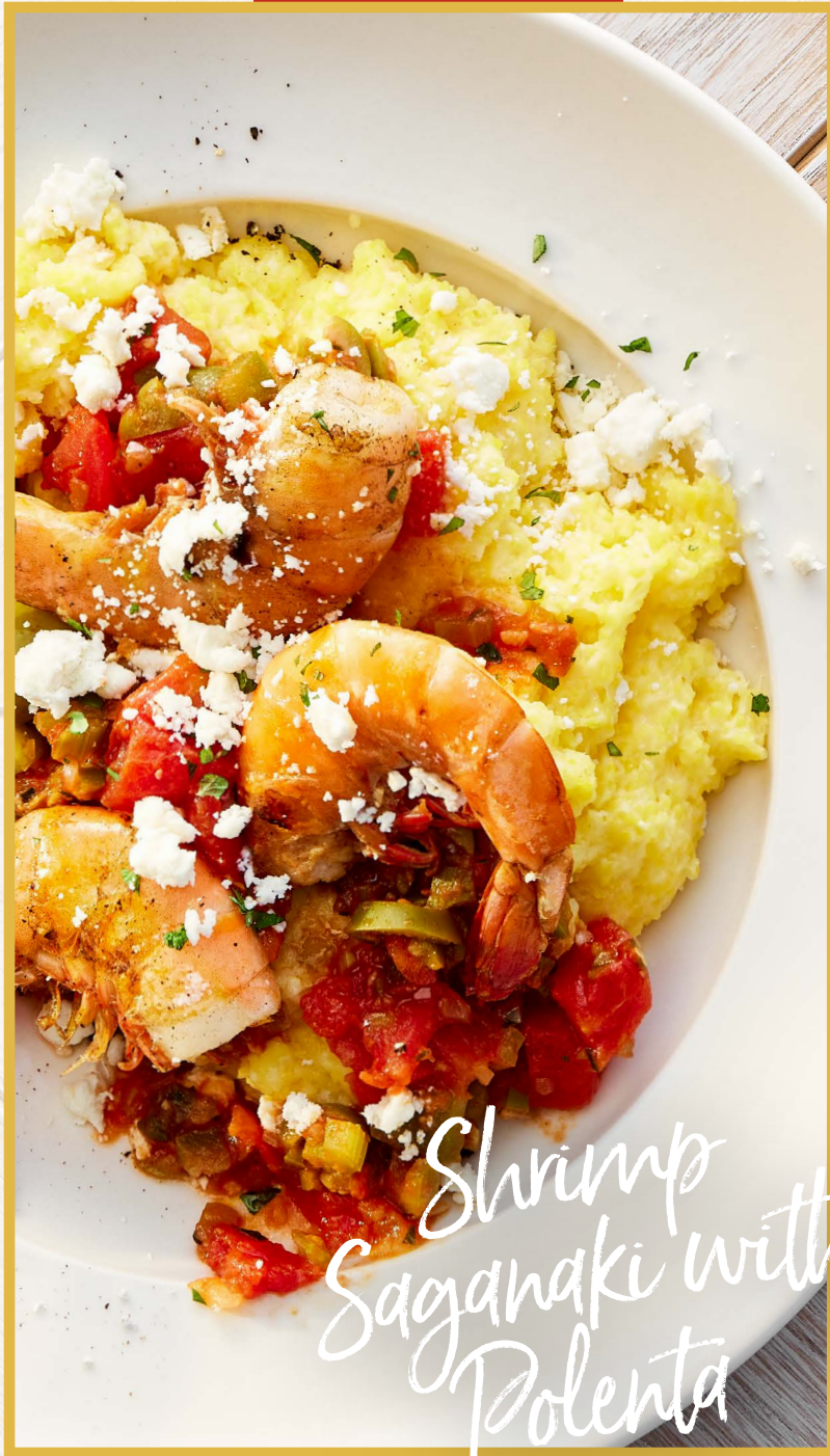
Shrimp Saganaki with Polenta